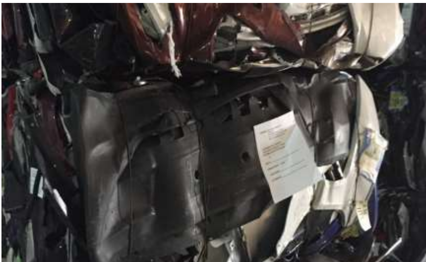
Figure 1. Baled Bumpers from Gary's U-Pull It

Geo-Tech Polymers received about 4,500 pounds of bumpers, baled from Gary's U-Pull It, as pictured in Figure 1.