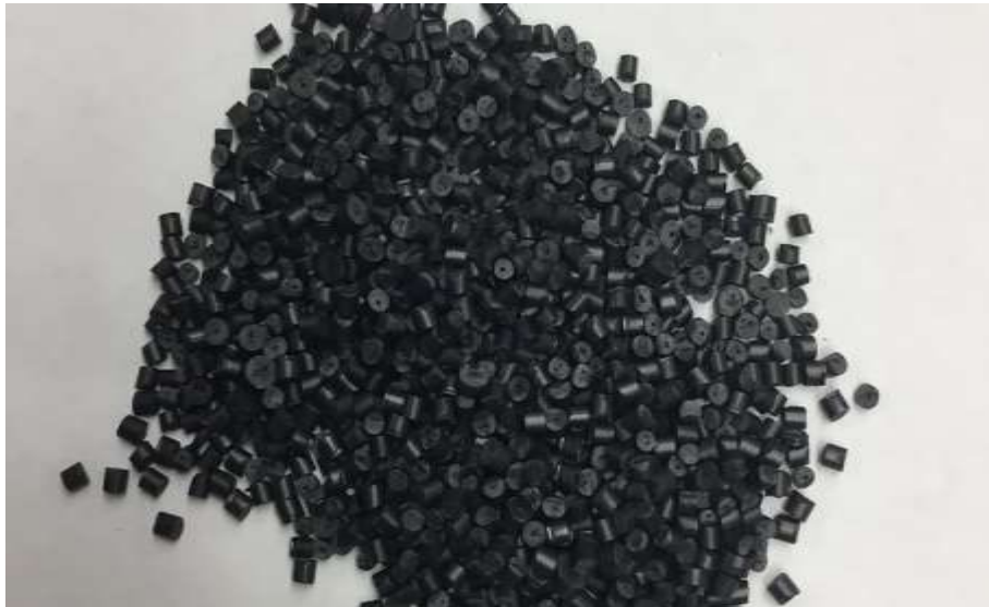
Figure 6. Post-Consumer Recycle (PCR) TPO Pellet recovered from ELV Bumpers (PCR Repro TPO-paint).

Geo-Tech was able to perform some preliminary physical property testing on these pellets. The Geo-Tech lab analysis is contained in Table 1.