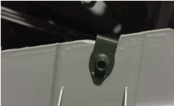
Figure 2. Metal Clips

The manual preparation required was relatively minimal. Examples of contamination requiring removal can be seen in Figures 2-4.