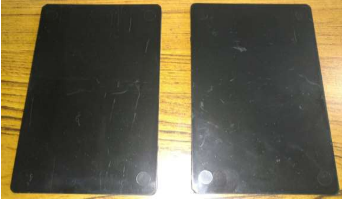
Figure 8. Plaques Molded by MCC with PCR Shred TPO+paint from Post Plastics

would only be considered as feedstock for non-visible utility application. The aesthetic limitations of the shredded TPO+paint is visible in Figure 8.