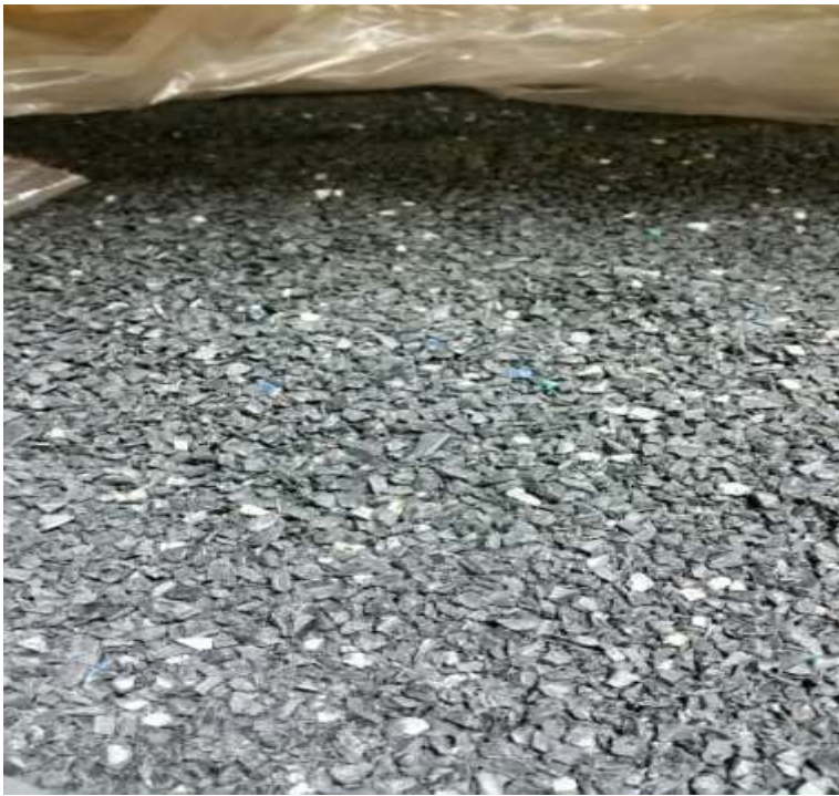
Figure 10. PCR Shred TPO+paint.

The PCR Shred TPO+paint sample received was much less consistent, having simply been shredded and granulated. The paint is still visibly present, as seen in Figure 10.