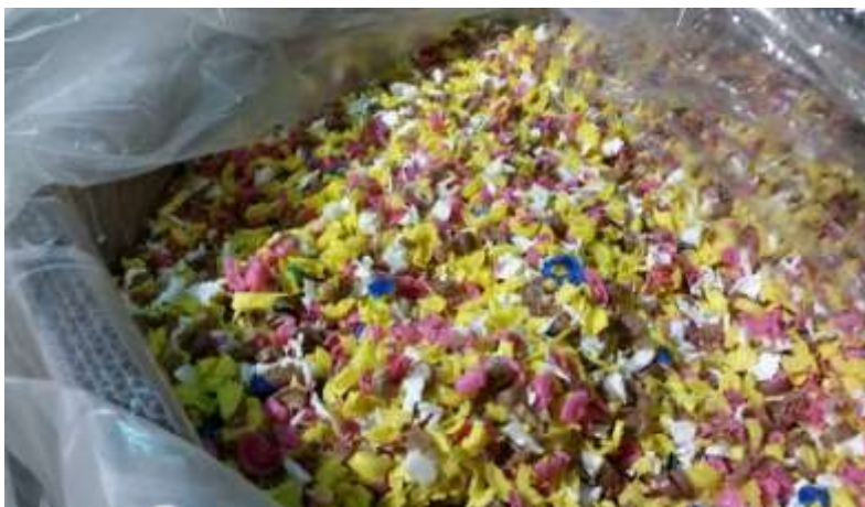
Figure 9. Current Material Mix Used by I2Tech for Customer Application

i2Tech received two samples of the ELV bumper material; PCR Repro TPO-paint and PCR Shred TPO+paint. The company did not perform physical property testing; rather, they took the samples directly into product application, molding the samples using transfer molds. For this particular application, which was pallets, the previous molder could not meet cost, quality and delivery expectations for the customer, so i2Tech was looking for cost-competitive materials to deliver on price point and performance expectations for their customer. Both TPO samples processed much better than the material currently being used for this customer. Current mix of material can be seen in Figure 9.