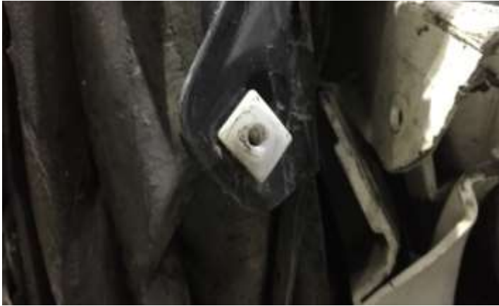
Figure 4. Nylon Clips

Once inspected and prepared, the bumpers were shredded, as seen in Figure 5.