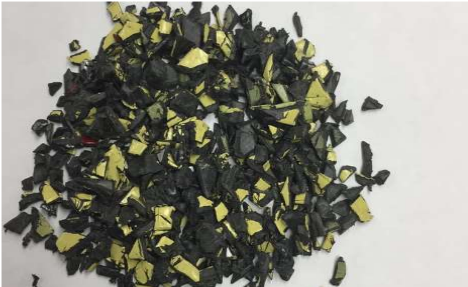
Figure 5. Shredded TPO Bumpers, Before Paint Removal (PCR Shred TPO+paint)

Once inspected and prepared, the bumpers were shredded, as seen in Figure 5.