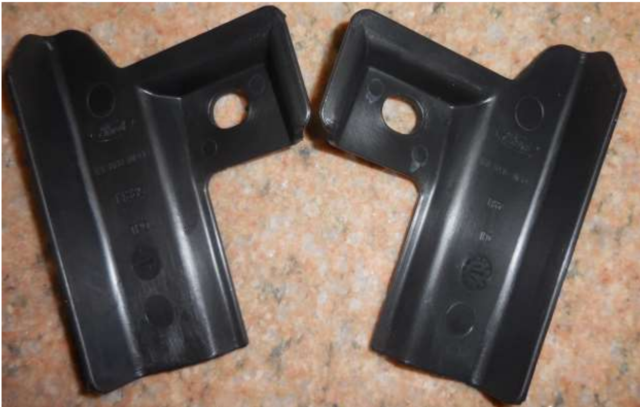
Figure 7. MCC Molded Parts from PCR Repro TPO-paint Provided by Geo-Tech

A few weeks after completing this study, MCC was asked by an automotive OEM to provide a sample of reprocessed TPO material for a secondary mud flap on a small-volume vehicle. Its primary requirement was that it needed to have a melt flow rate greater than 20 grams per 10 minutes. MCC decided to submit the Repro TPO-paint from Geo-Tech. The material was molded in mid-February 2017 and was given an initial approval by the Tier 2 Injection Molding company. A picture of parts molded from the material is provided in Figure 7 below. MCC will continue testing on this material to provide all the necessary data to the OEM for final approval.